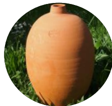
CLAY WATER TANK