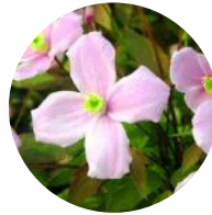
Clematis montana 'Mayleen' Clematis montana 'Mayleen'