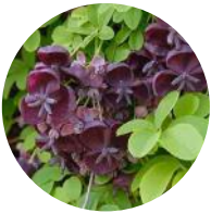
Chocolate vine Akebia quinata