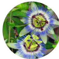
Blue Passionflower Passiflora caerulea