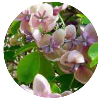
Chocolate vine 'Silver Bells' Akebia quinata 'Silver Bells'