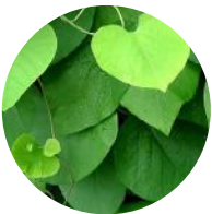
Pipe vine Aristolochia macrophylla