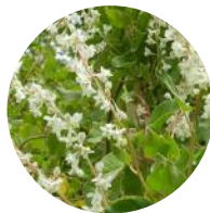
Silver lace vine Polygonum aubertii