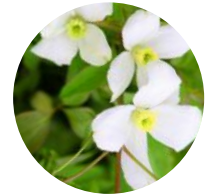
Clematis montana 'Grandiflora' Clematis montana 'Grandiflora'