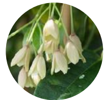
Sausage vine Holboellia coriacea